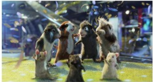
G-Force Feathers Software: Houdini & Proprietary