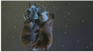
G-Force Atmosphere/Smoke Software: Houdini & Proprietary